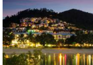
Club Wyndham Airlie Beach 30-40 hours per week Live in Airlie Beach