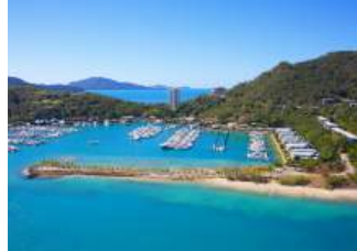
Hamilton Island Full-time work - 38 hours per week Live on island in staff accom