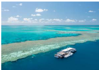
Cruise Whitsundays 30-40 hours per week Live in Airlie Beach