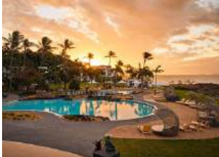
Daydream Island Live in Airlie Beach or on island (depending on your role)