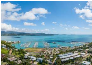
Coral Sea Marina Resort 25-30 hours per week Live in Airlie Beach

With the guidance of your dedicated Program Leader, you will undergo a job application process based on the current job availability and the options that are best suited to you. A job will be secured with one of our partners before you move.