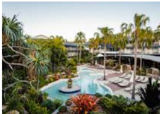
Mantra Club Croc 25-30 hours per week Live in Airlie Beach